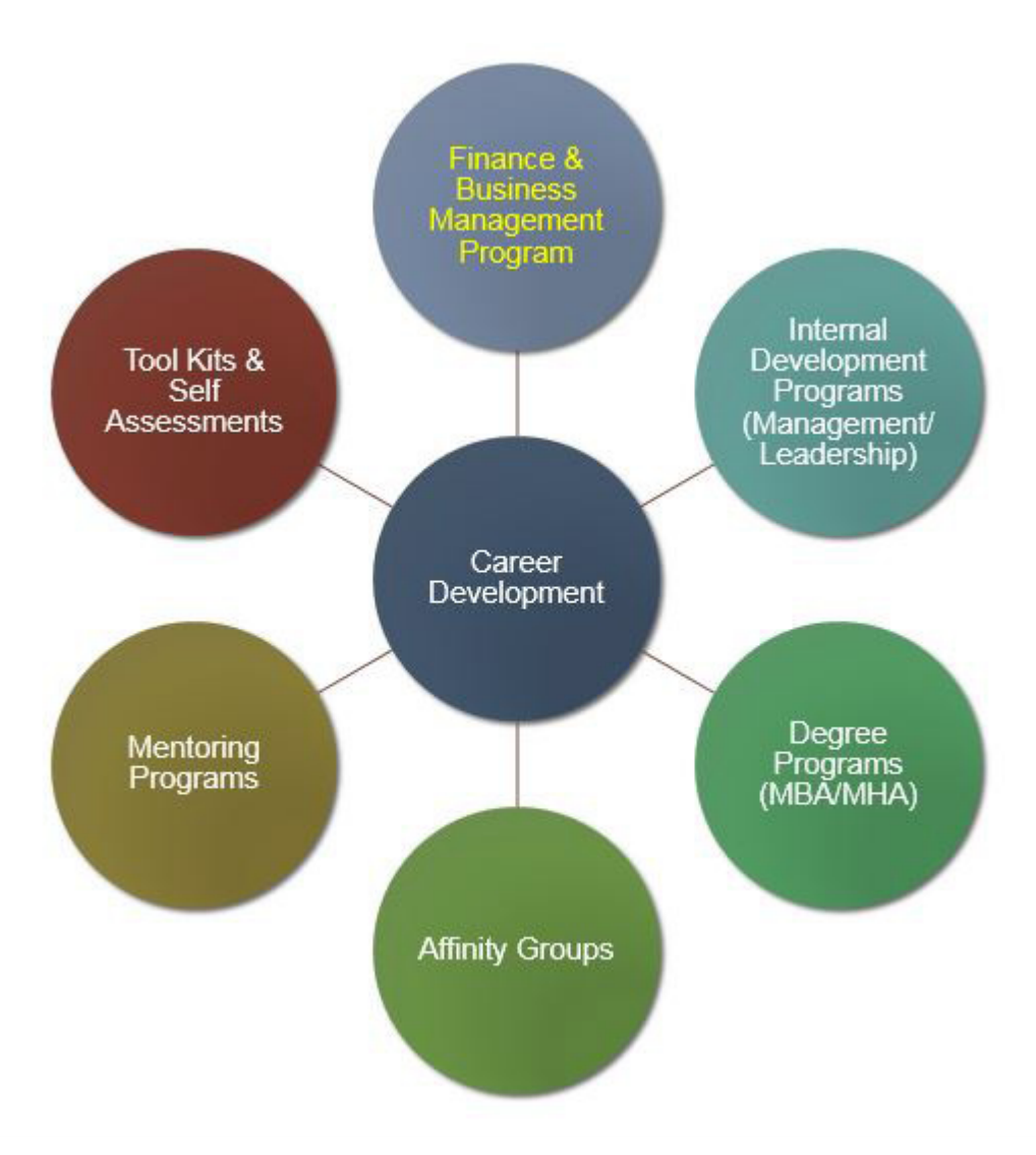
Figure 1. Recommended Career Development Strategies